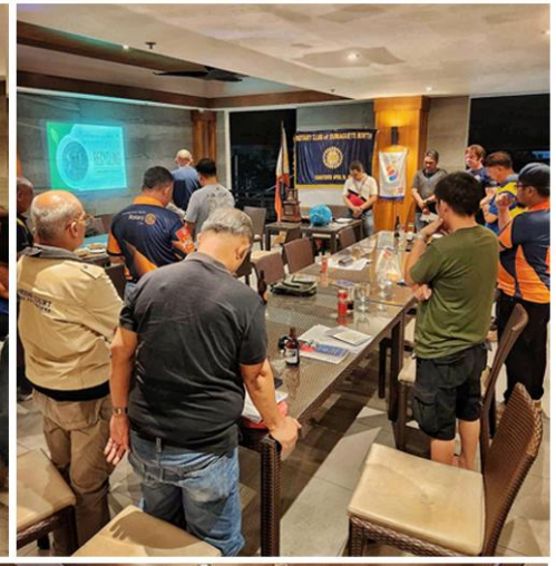
01122024 - RCDN 23rd Regular Meeting and Fellowship at Royal Suites Inn.